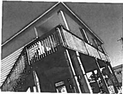
SIDE AND REAR VIEW

If using the Elevation Certificate to obtain NFIP flood insurance, affix at least 2 building photographs below according to the instructions for Item A6. Identify all photographs with date taken; "Front view" and "Rear view"; and, if required, "Right Side View" and "Left Side View." When applicable, photographs must show the foundation with representative examples of the flood openings or vents, as indicated in Section A8. If submitting more photographs than will fit on this page, use the Continuation Page.