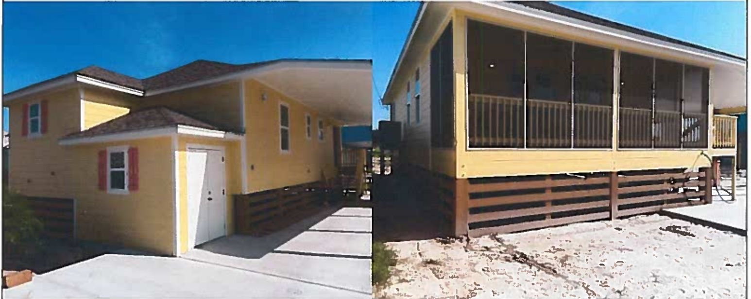
FRONT AND SIDE VIEW

If using the Elevation Certificate to obtain NFIP flood insurance, affix at least 2 building photographs below according to the instructions for Item A6. Identify all photographs with date taken; "Front view" and Rear view"; and, if required, "Right Side View" and "Left Side View." When applicable, photographs must show the foundation with representative examples of the flood openings or vents, as indicated in Section A8. If submitting more photographs than will fit on this page, use the Continuation Page.